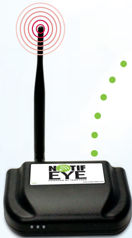
#15501 Ethernet Gateway (Kit #15901)