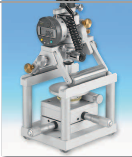
minimum transport case.

An additional stand with 25 x 25 mm cross table and optional rotating table is available to allow use of the 2034-CIL-300-ZX as a laboratory system. This stand is very useful when performing depth measurements on small parts. In such applications the parts can be positioned precisely with the cross table. Further optional accessories include the two V-blocks, which can be inserted into the rotating table using a fitted pin in the bottom. This allows applications such as quickly and reliably measuring the depth of scratches on round parts without investing a great deal of time. This microscope is also suitable for use as a mobile laboratory for measuring objects such as micrographic sections or other parts using the interchangeable objective and ocular lenses available as options. The 2034-CIL-300-ZX is shipped in an extremely sturdy plastic transport box. When ordered with the ST-CIL stand, the set is shipped in a special alu-